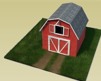
Proposed Restroom Plan

The Restroom Fundraiser "Barn Raising" went well even though it was a cool day. We had 9 booths and 84 items donated from 26 business and 11 individuals for the live and silent auctions. We would like to thank every one who contributed and helped make the day a success. To date we have raised $2,714 to begin our restroom fund. We realize that this is just a beginning and much work is needed yet to be able to provide our visitors with drinking fountains, proper hand washing, and restroom facilities.