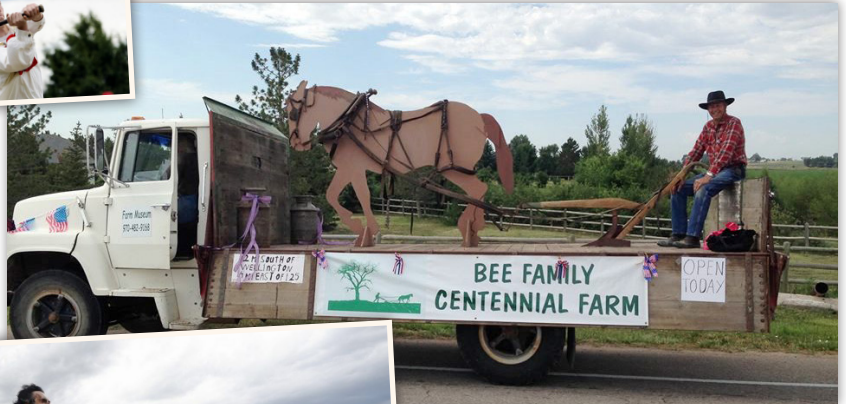
We had our annual float in the Wellington 4th of July Parade